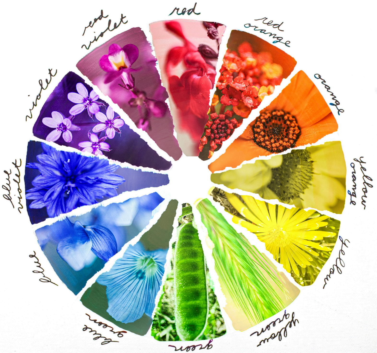
*All Flowers Shot at MMHS